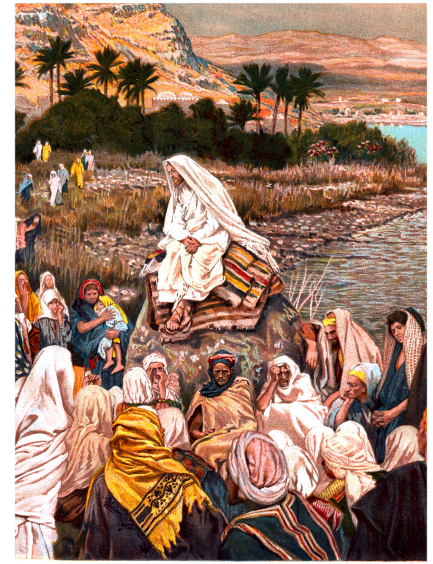
JESUS TEACHING ON THE SEA SHORE